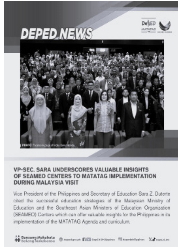
VP-SEC. SARA UNDERSCORES VALUABLE INSIGHTS OF SEAMEO CENTERS TO MATATAG IMPLEMENTATION DURING MALAYSIA VISIT Vice President of the Philippines and Secretary of Education Sara Z. Duterte cited the successful education strategies of the Malaysian Ministry of Education and the Southeast Asian Ministers of Education Organization (SEAMEO) Centers which can offer valuable insights for the Philippines in its implementation of the MATATAG Agenda and curriculum.

"Making the curriculum relevant is one of our thrusts, and the lessons on science and math teaching from RECSAM [Regional Centre for Education in Science and Mathematics] can help us achieve this," VP-Sec. Sara said in her speech during an official visit to SEAMEO [Regional Centre for Special Educational Needs] Regional Tropical Medicine and Public Health (TROPMED) Network Malaysia.